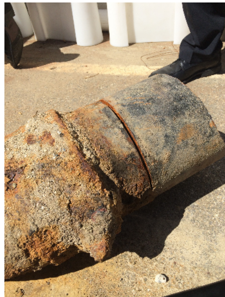
CSU NORTHRIDGE HOT WATER DISTRIBUTION FAILURE