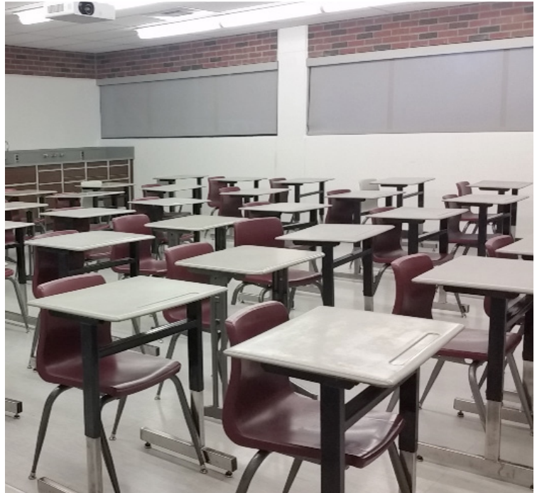
CSU CHICO HOLT HALL CLASSROOM RENOVATION