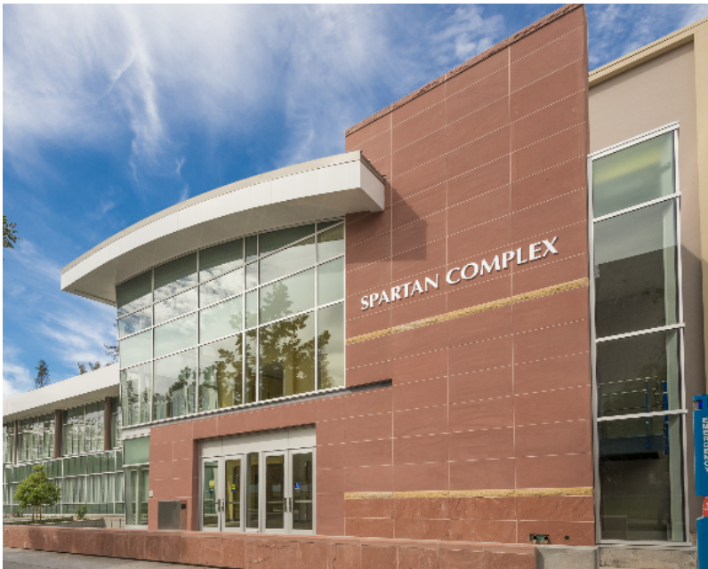
SAN JOSÉ STATE RENOVATED SPARTAN COMPLEX