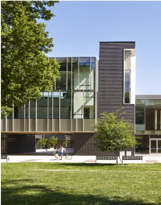
CSU CHICO TAYLOR II REPLACEMENT BUILDING