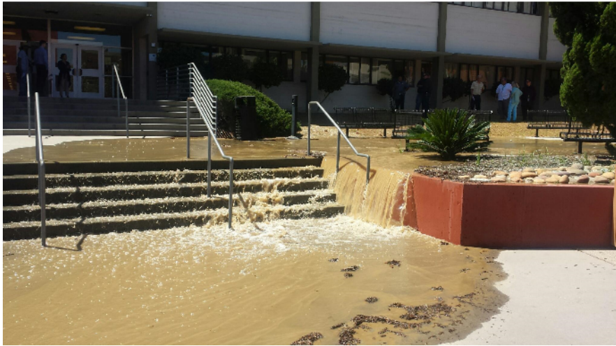
CAL STATE LA WATER LINE BREAK