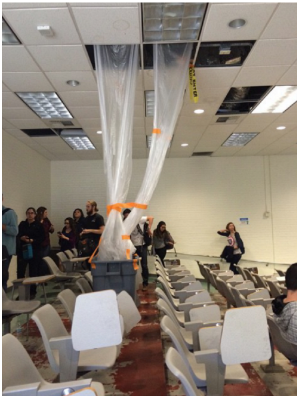
CSU CHICO PHYSICAL SCIENCE BUILDING