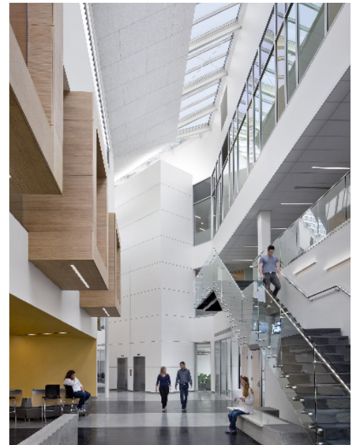
CSU MONTEREY BAY ACADEMIC II