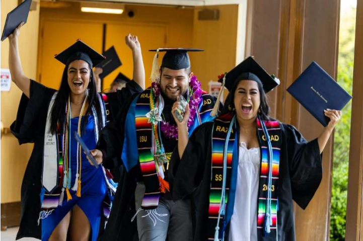
Sonoma State University

"The future belongs to those who believe in the beauty of their dreams."