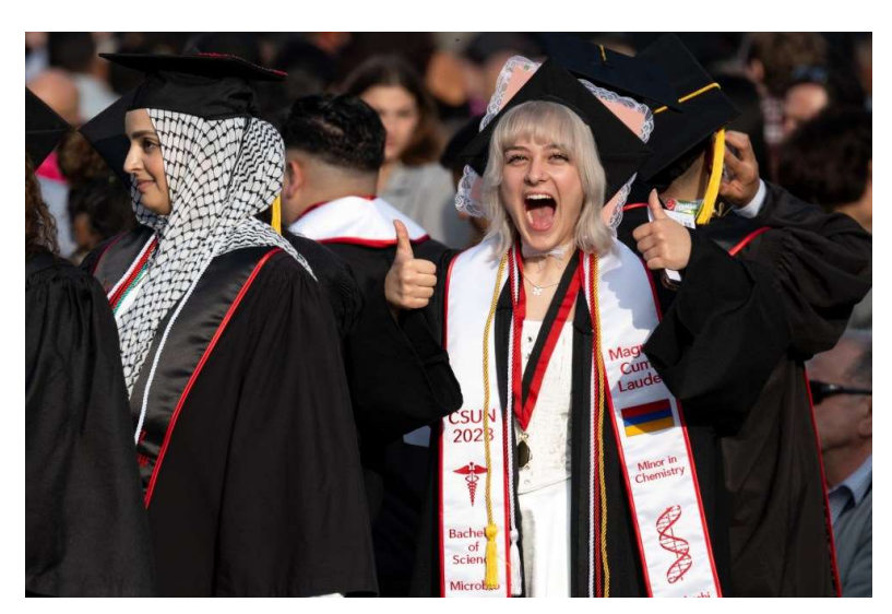
California State University, Northridge