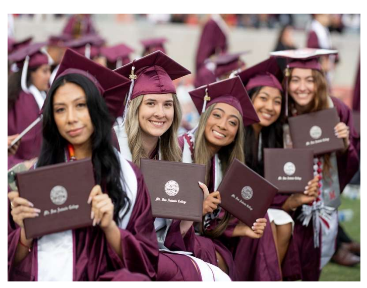
Mount San Antonio College Voted #1 Community College in California for 2024