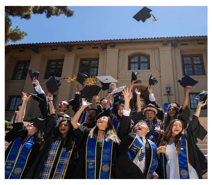
University of California Riverside