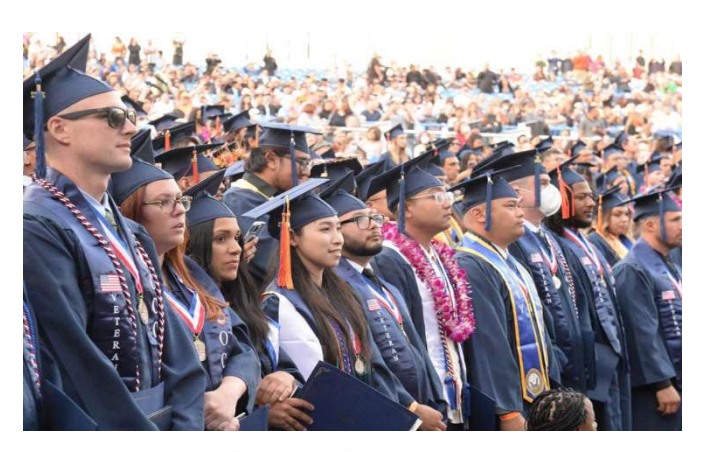
Orange Coast College

"Your education is a dress rehearsal for a life that is yours to lead." — Nora Ephron